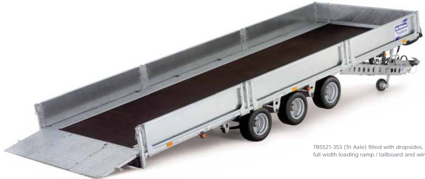
TB5521-353 (Tri Axle) fitted with dropsides, full width loading ramp / tailboard and winch.

2.3m wide versions of the TB range will be introduced in late 2010.