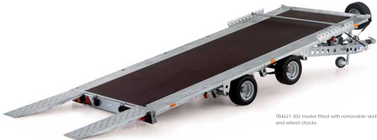
TB4621-302 model fitted with removable skids and wheel chocks.